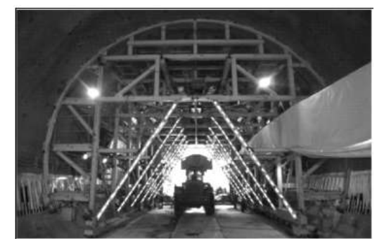
Fig. 3 Waterproof Board Laying and Hanging Trolley

In addition, the project also deploys self-propelled steel gantry cranes, automatic waterproofing board installation trolleys, hydraulic lining installation trolleys for the lining works, and in the later stages, cable trench trolleys for cable trench construction. The following are the advantages of